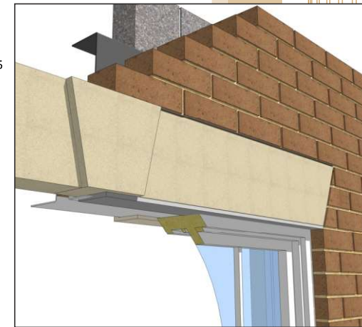
Typical installation detail

Our Heads are non structural and should be used in conjunction with supporting lintels. They are available to fit standard openings or a bespoke opening to your request. Internal Stainless steel reinforcing and lifting lugs can be cast in to order. If you require any further information, please call 01258 472685 and ask to speak to a member of our technical department. All joints shown 6mm